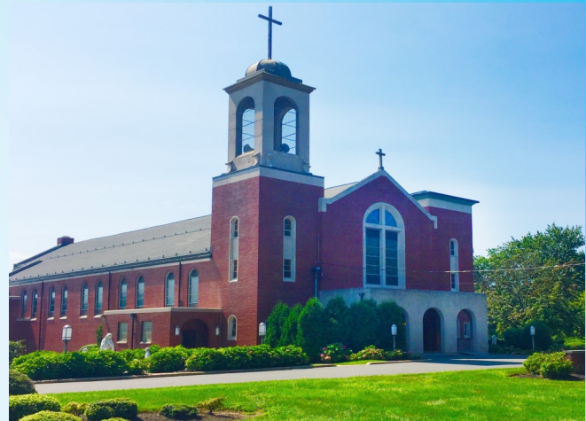
Our Lady of Good Counsel church 137 West Upper Ferry Road, West Trenton,