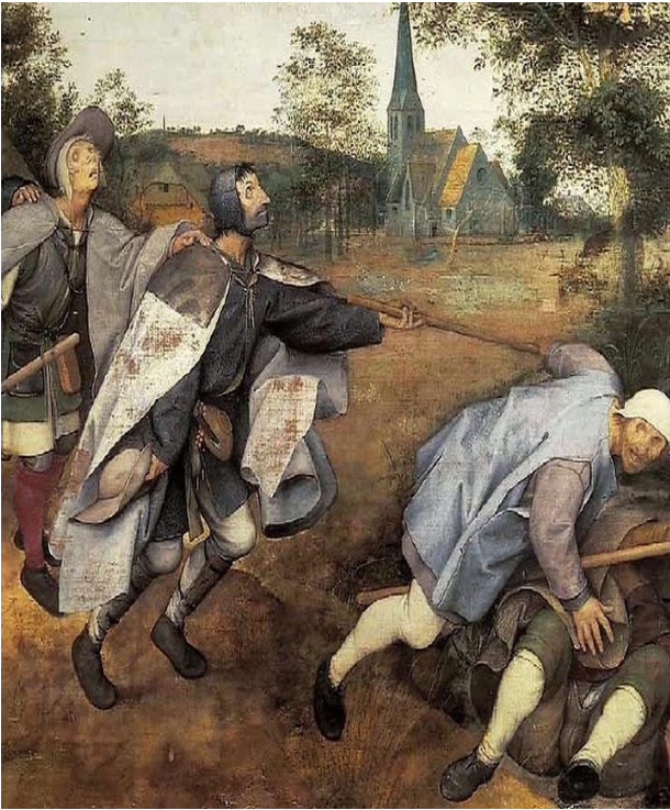
Pieter Bruegel the Elder, The Blind leading the Blind, 1568.

When you hold a banquet, invite the poor, the crippled, the lame, the blind; blessed will you be because of their inability to repay you.