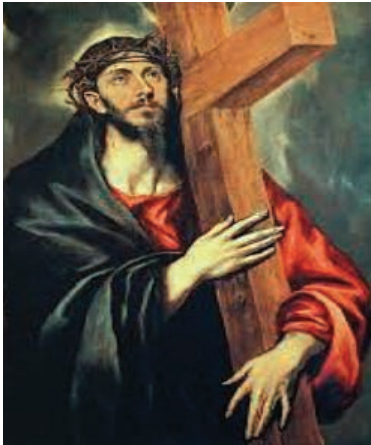
El Greco, Christ Carrying the Cross, 1578

So be perfect, just as your heavenly Father is perfect