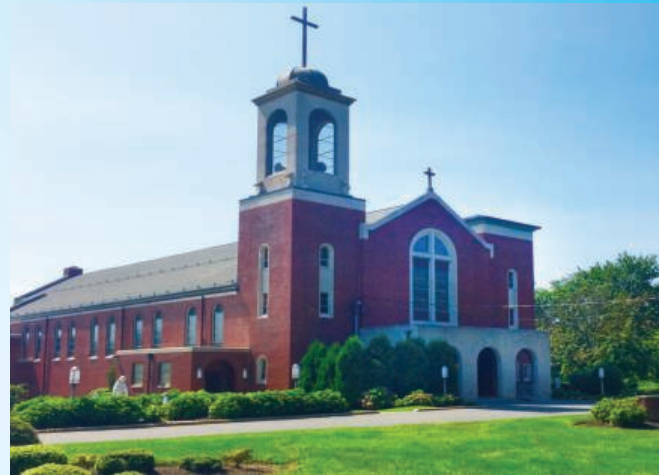
Our Lady of Good Counsel church 137 West Upper Ferry Road, West Trenton,