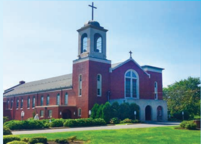
Our Lady of Good Counsel church 137 West Upper Ferry Road, West Trenton,