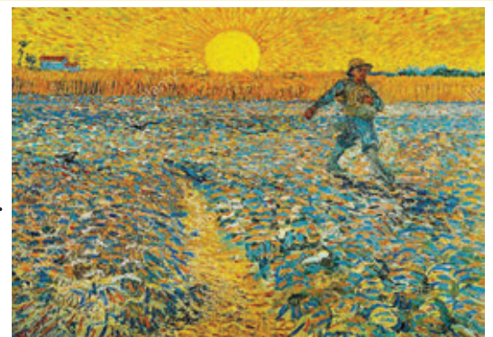
Vincent van Gogh The Sower, 1888

“This is how it is with the kingdom of God; it is as if a man were to scatter seed on the land and would sleep and rise night and day and through it all the seed would sprout and grow.” ( Gospel )