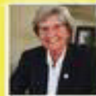
...and members of the Church of Saint Ann and the Saint Ann School